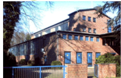
Water works Uevекoven