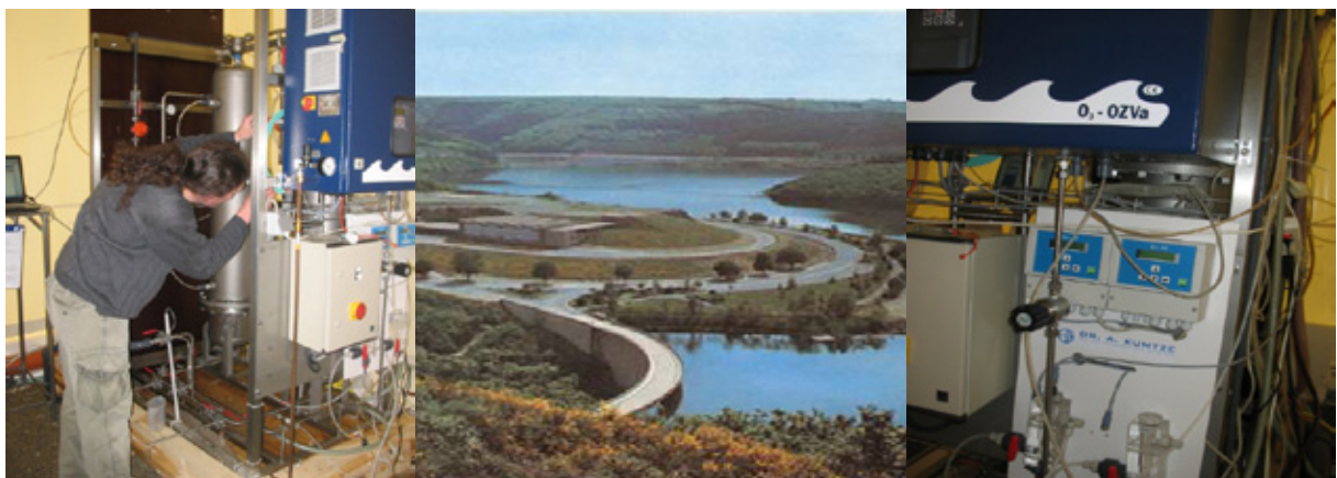
Pilot plant at the river dam Esch-sur-sûre, Luxembourg